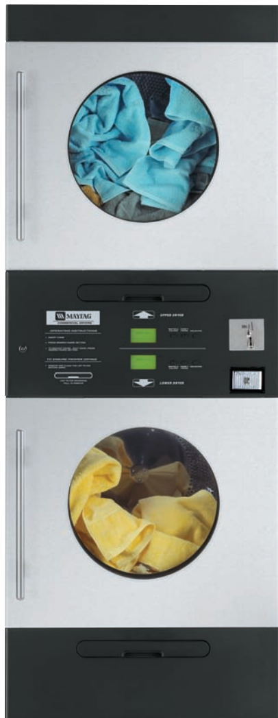
Shown in Stainless Steel.